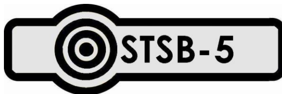
Shear beam loadcell

Single fixed beam loadcell, rotundity section structure, simple to install, easy to use, good interchange ability. Alloy steel, nickel plated, special potted seal and cover board seal, good moisture proof, ideal for various hostile environment. Widely used in fodder, rubbish transport truck, hopper scale, etc.